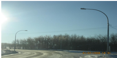
121 & 101