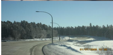
Wonowon B to B