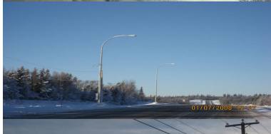
Wonowon Nomadic Camp