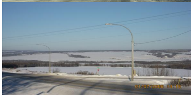
271 & 101